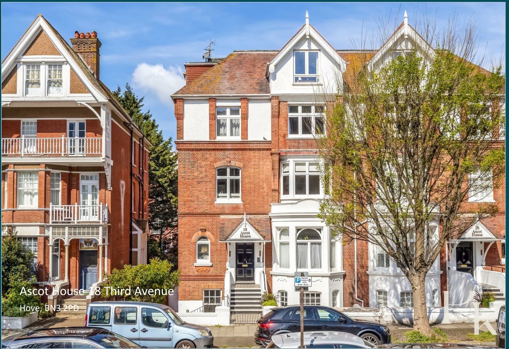
Ascot House 18 Third Avenue Hove, BN3 2PD